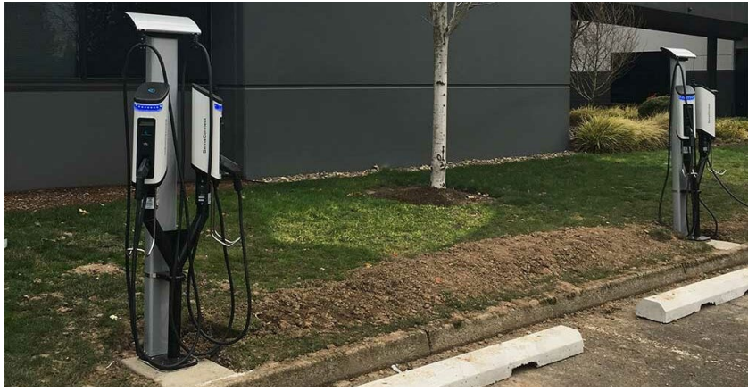
Figure 2: SemaConnect EV Charger

SemaConnect is an electric vehicle infrastructure company with several charging locations in the Tampa region. The company installs EV charging stations for commercial, multifamily, and fleet applications. SemaConnect manages two private charging stations located on residential