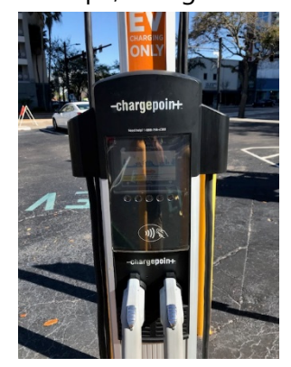
Figure 1: ChargePoint EV Charger

stations and one private charging station. ChargePoint's current EV charging stations in Downtown Tampa can accommodate both Level 1 and Level 2 chargers and can service two parking spaces. Drivers can pay using the ChargePoint mobile app, a contactless credit card, or via assistance from a station attendant if available.