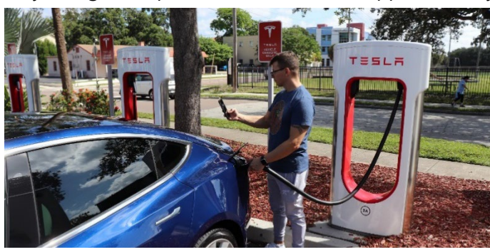
Figure 4: Tesla Superchargers

Tesla offers Destination charging stations and Supercharger stations at various hotels, restaurants, and shopping centers in Tampa and across the United States. Up until 2017, Tesla paid for the installation cost but has since then shifted the installation cost back to the facility owners. Tesla EV charging stations are often complimentary for Tesla owners or if they are a patron of the facility. It is notable that Supercharger stations were introduced in 2012 and can fully charge a depleted Tesla vehicle in approximately 30 minutes. These Supercharger stations