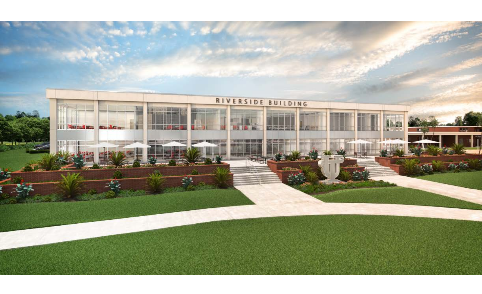
THE UNIVERSITY OF TAMPA RIVERSIDE BUILDING