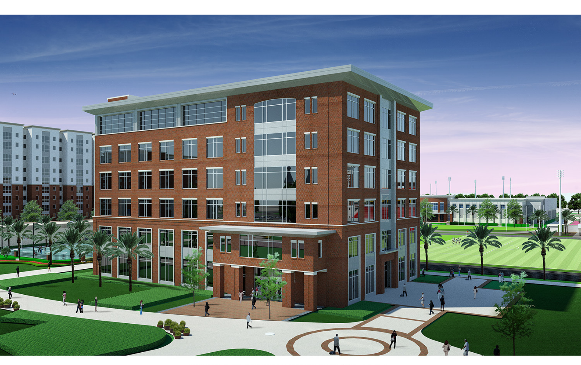
The University of Tampa Graduate and Health Studies - Phase I