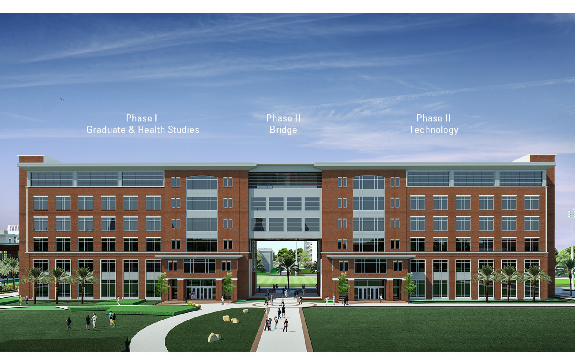
The University of Tampa Technology - Phase II