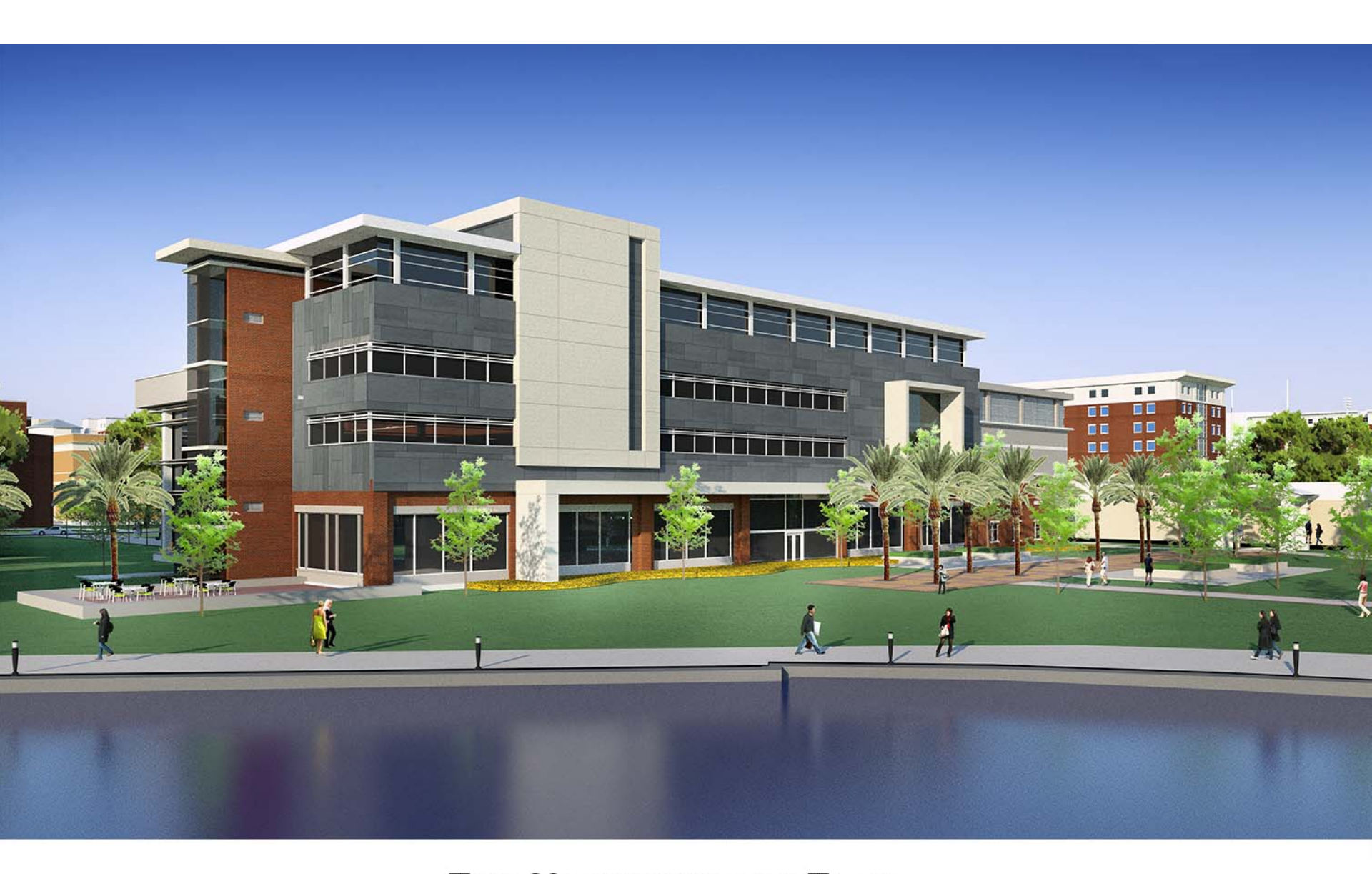
THE UNIVERSITY OF TAMPA SCIENCE BUILDING